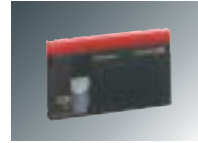
DVCPRO HD Cassette AJ-HP126EXG (126 min.)