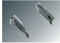
Rack Mount Adapter AJ-MA75P