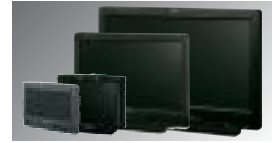
HD/SD LCD Monitor BT-LH80W, BT-LH900A BT-LH1700W, BT-LH2600W