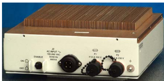
Field Replaceable Power Supply

Mounting brackets are supplied to mount the high power amplifier to most popular antennas.