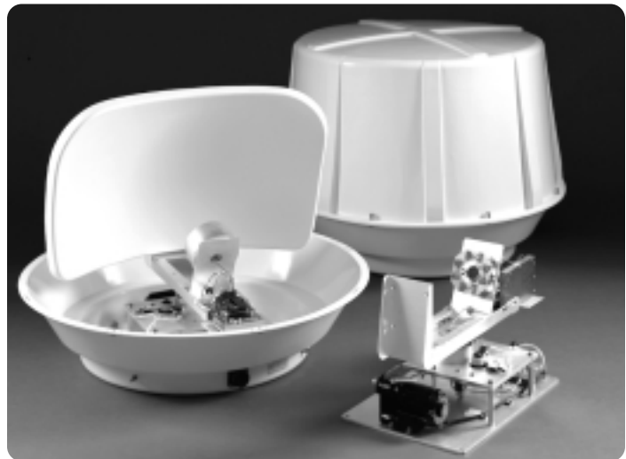
UltraScan Antenna with radome removed

842746-2-x .....Control cable and connectors (x = specify length in feet) 101609-1 .....High Gain Linear Amp, 22 dB, .....DC without bypass